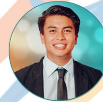
ACE TIMTIM Club Young Leader's Contact / Sgt. at Arms